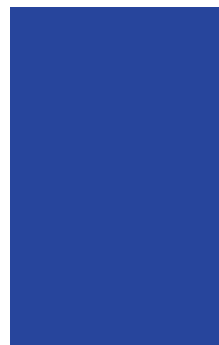
BE5-0632 BRIGHT BLUE