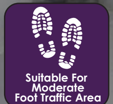
Suitable For Moderate Foot Traffic Area